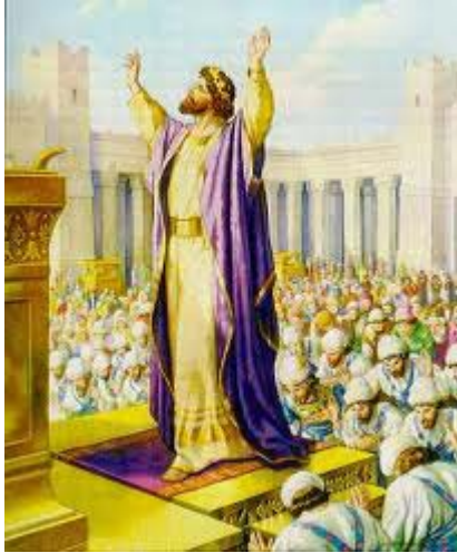
2 CHRON 20:1-30.

It was told King Jehoshaphat of Judah that a vast army from Edom was coming from the other side of the Dead Sea to attack Judah. Jehoshaphat was frightened and prayed to the Lord. Then he gave orders for a fast to be observed throughout the country. From every town and city of Judah people hurried to Jerusalem to ask the Lord for guidance. Then Jehoshaphat stood before the assembled people who had gathered in the new courtyard of the temple and prayed aloud and long to God about the trouble and ended by saying, ' we don't know what to do, but we look to you for help''. And all the men of Judah, with their wives and children just stood before the Lord. Then the Spirit of the Lord came upon a Levite, Jahaziel, who said, ' listen King Jehoshaphat and all who live in Jerusalem! Do not be afraid or discouraged because of this vast army, for the battle is not yours but God's. Tomorrow march down against them. You will not have to fight this battle. Take up your positions, stand firm and see the deliverance the Lord will give you''.