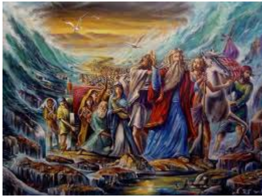
EXODUS 12:29-44 / EX 14: 27-31.

God had promised Abraham that after Israel had served for 400 years of affliction in Egypt, they would come out with great possessions {Gen 15:14 / Ps 105:37}.