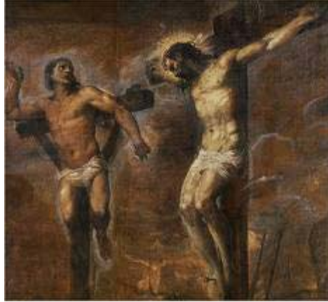
MATT 27:38 & 44 / LUKE 23:39-43

Two thieves' were crucified together with Jesus, one on his left and one on his right side. One of the robbers or criminal who hung there with Jesus hurled insults at him saying, "Aren't you the Christ? Save yourself and us!" But the other criminal rebuked him saying, "don't you fear God! Even when you have been sentenced to die? We deserve to die for our crimes, but this man hasn't done anything wrong". Then he said, "Jesus, remember me when you come into your Kingdom".