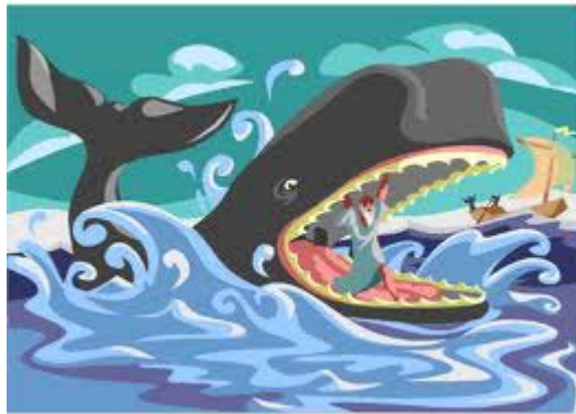
JONAH CHAPTERS 1 & 2.

God sent the Prophet Jonah to go to the great city of Nineveh and to preach against it, because of its wickedness. But Jonah ran away from before the Lord and headed for Tarshish after finding a ship in Joppa.