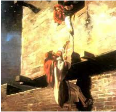
JOSHUA 2 / JOSHUA 6: 15-23.

Joshua sends 2 Israelite spies on a reconnaissance and espionage mission of the city of Jericho reputed to be impregnable because of her walls. Once inside the walls of the fortified city of Jericho, the King was told of their presence and also that they had gone into the house of a prostitute named Rehab and that they were still there.